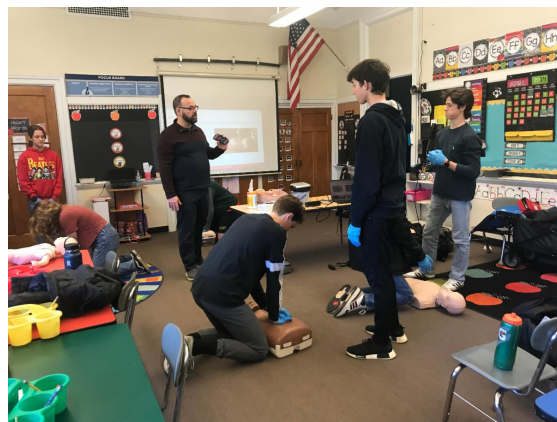
Scenes from the Red Cross First Aid/CPR/AED (adult and pediatric) course in late March!